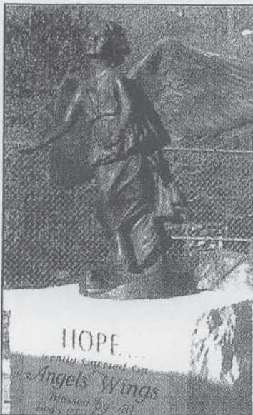
A Christmas Box Angel in Westerly, R.I.

depicts a woman mourning the loss of her child while at the base of an angel monument.